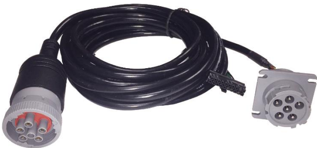
6 Pin Gray Power Harness: CAB-110340