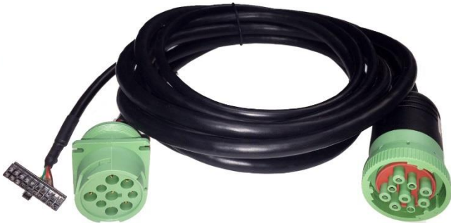
9 Pin Green Power Harness: CAB-110351

For vehicles with a J-Bus style port we offer various types of plugs to suit your installation needs. The harness plugs directly into the vehicles J-Bus port and directly into our device. The device can then be installed under dash as close to the windshield as possible.