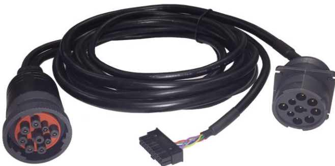
9 Pin Gray Power Harness: CAB-110331